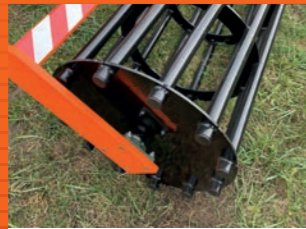
TUBULAR ROLLER D=540MM OR D=620MM