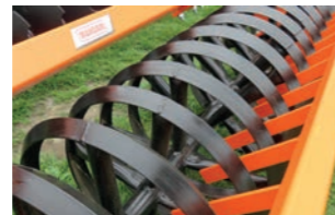
V-RING ROLLER D=600 MM

Each roller ring is built of 4 independent springs, thanks to which the wheels fall into a characteristic vibration, which ensures better compaction and leveling of the ground even in difficult cultivation conditions