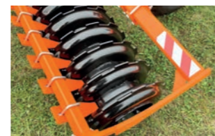
DISC ROLLER D=600 MM

Standard C-ring rims welded to the oversized axle design for additional toughness. Recommended for toughest conditions.