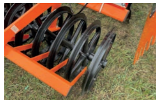
T-RING ROLLER D=600 MM

Recommended for medium and heavy soil. Exceptional crumbling and pressing action. Very aggressive, ideal for pre-sowing cultivation.