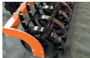
SPRING ROLLER D=560 MM

Good for a reduced tillage operations. Great soil compression due to large pressing area.