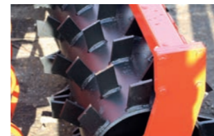
PACKER ROLLER D=600 MM

Recommended for medium and heavy soil. Good crumbling and pressing action. Creates grooves on a field's surface – good for water penetration.