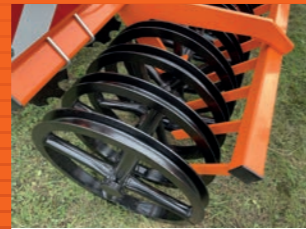
C-RING ROLLER D=600 MM

Recommended for medium and heavy soil. Offering soil-to-soil action. Creates grooves on a field's surface – good for water penetration.