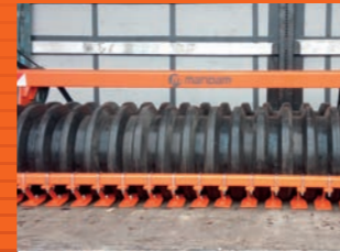
RUBBER ROLLER D=500 MM

Recommended for medium and heavy soil. Offering soil-to-soil action. Creates grooves on a field's surface – good for water penetration.